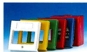
RANGE OF CASING COLOURS White, Yellow, Green, Red, Blue