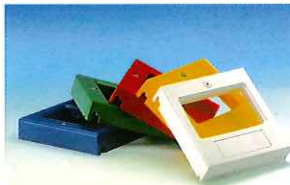
RANGE OF CASING COLOURS White, Yellow, Green, Red, Blue